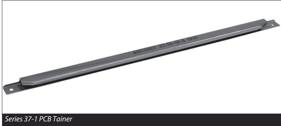
Series 37-1 PCB Tainer